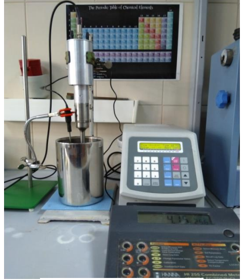
Fig. 1. Ultrasonic reactor

- anaerobically digestion of three ultrasonicated sludge samples and one blank sample (nonultrasonicated) using a battery tests equipment model Puls Flow Respirometer PF 8000 placed inside the incubator - shaker (Brunswick Scientific - Innova 44, Fig. 2).