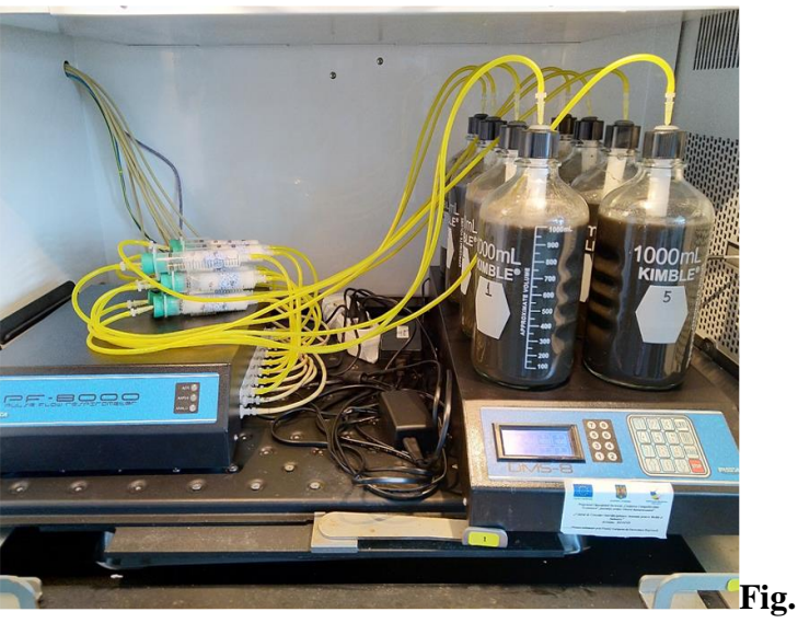
2. Anaerobically digestion battery tests

The main operational conditions for ultrasonic pretreatment were as following: