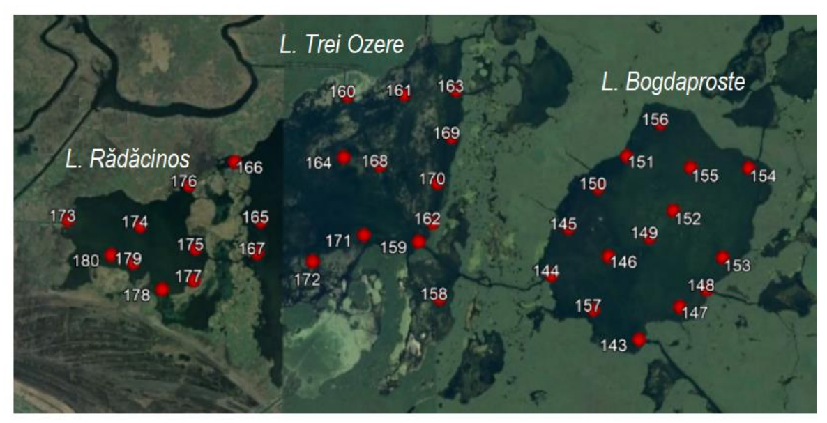
Fig. 3. GPS locations for sampling points

The samples were investigated using water sampling field equipment and techniques as: Secchi disc, WTW Multiline P4 Multiparameter, Hach 2100 P Turbidimeter, Portable Spectrophotometers HACH DR 5000 UV-Vis and DR 2000. The physical-chemical testing and analysis protocols were performed according to standard methodologies, at specific research laboratories - National Institute for Research and Development of Marine Geology and Geo-ecology – GeoEcoMar. In addition, the concentrations of a number of technophilic elements (Cd, Co, Cr total, Cu, Ni, Pb and Zn) were